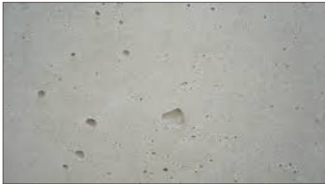
2. concrete: off form