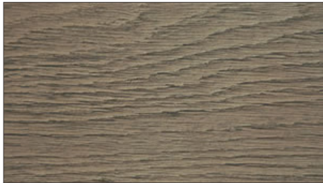
1. urbanline millboard: golden oak