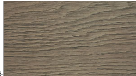
1. urbanline millboard: golden oak

https://www.urbanline.com.au/products/millboard-decking/