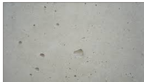
2. concrete: off form

http://www.concreteblonde.com.au/faq.htm