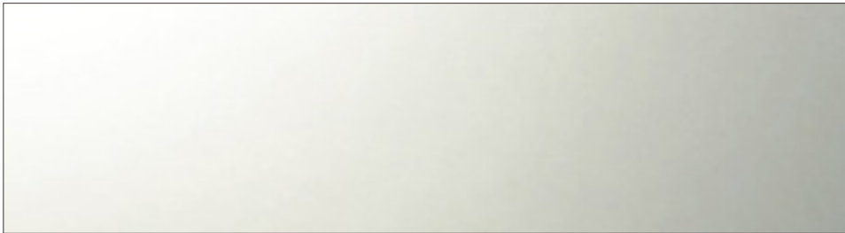
5. glass: clear